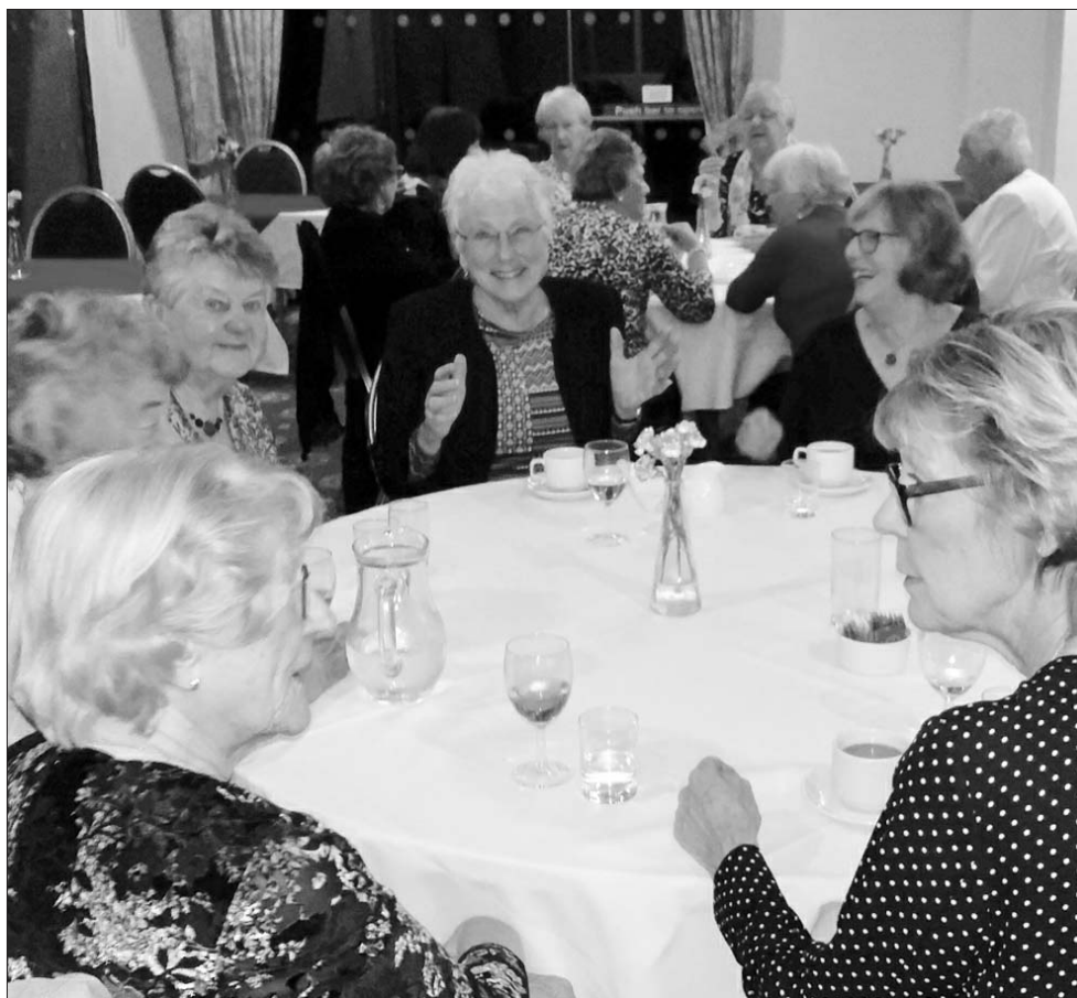
This is a photo of our birthday dinner at Radyr Golf Club.

I have already referred to the Peace Festival which took place in Radyr from 8th to 11th November. The