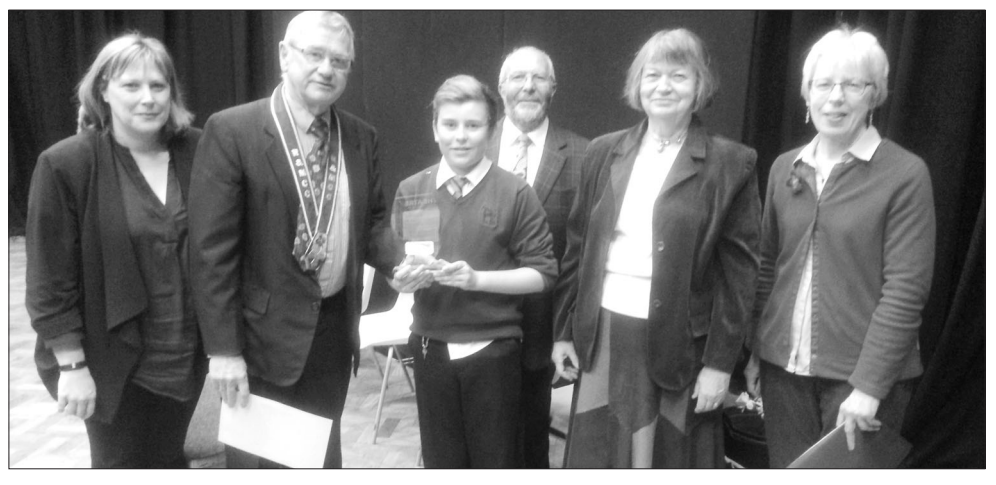
Radyr Comprehensive School winner