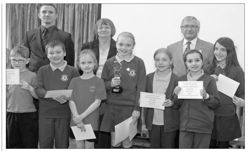
Radyr Primary School Year Group Winners

"First I chose my favourite sport, which is dance and started to think of some ideas of not just making it about doing a trick or a dance. I used the person's feelings to make it different. This isn't a personal experience but this has happened to other people and I thought it would maybe have an effect on people who might be going through this. The message is basically if people are saying you can't do it just ignore it and believe in yourself. Then I thought of good adjectives, similes and metaphors and put it all together to make my poem. I was very surprised to have my poem take 1st place. I was very pleased and glad I took part".