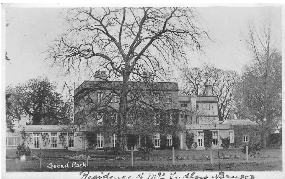
Has anyone lost this postcard dated January 10th 1911? It was found inside a book recently returned to Radyr Library