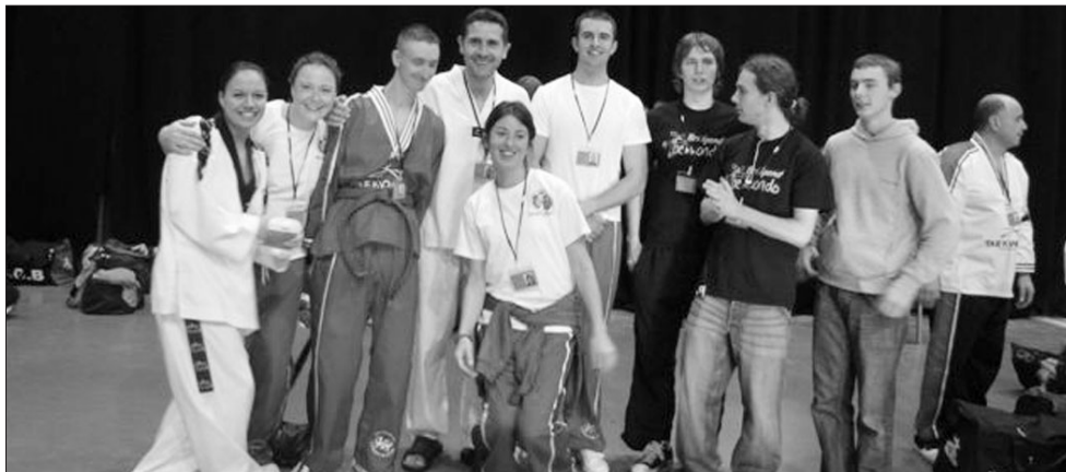
Students from Bridgend in the morning before the opening ceremony

Particular praise goes to Nicola Turecek as there were 92 competitors in her division and 3 hours to complete.