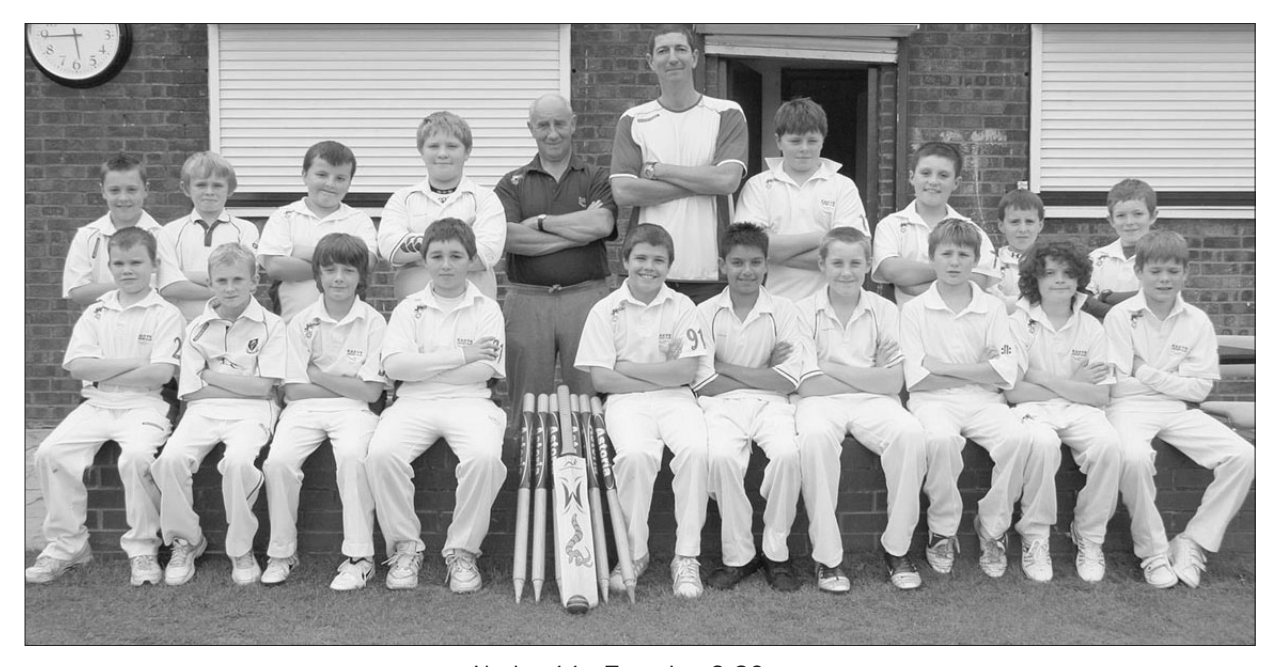
Under 11s Tuesday 6.30pm