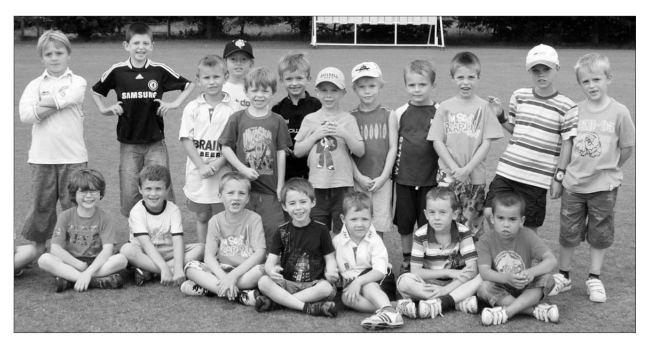
Under 7s Tuesday 5.30pm