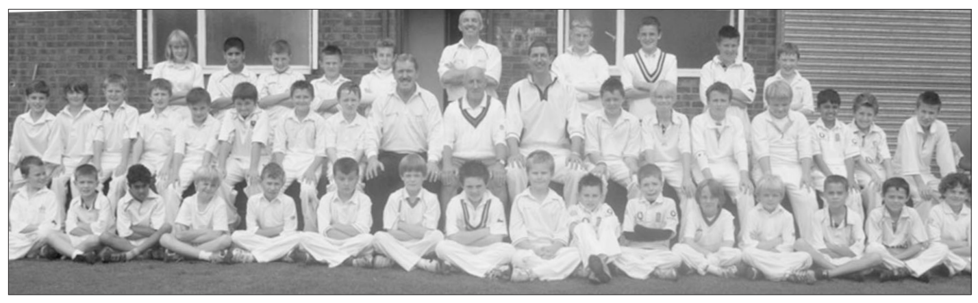
Under 9s Friday 6.30pm